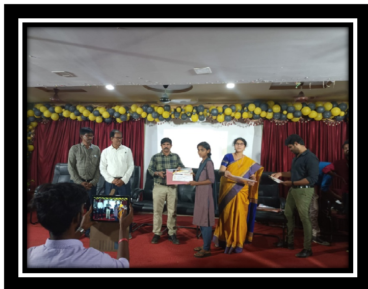
PRIZE DISTRIBUTION IN SCIENCE DAY PROGRAM