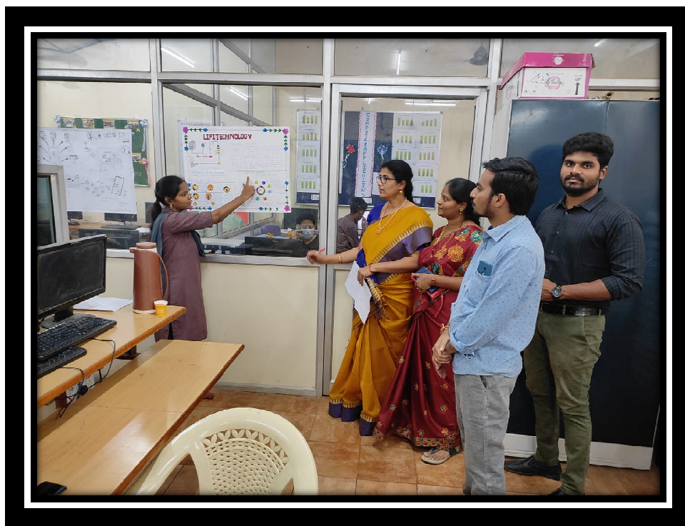
Fig: Student presenting PPTs on the occasion of Science day (28-2-23)