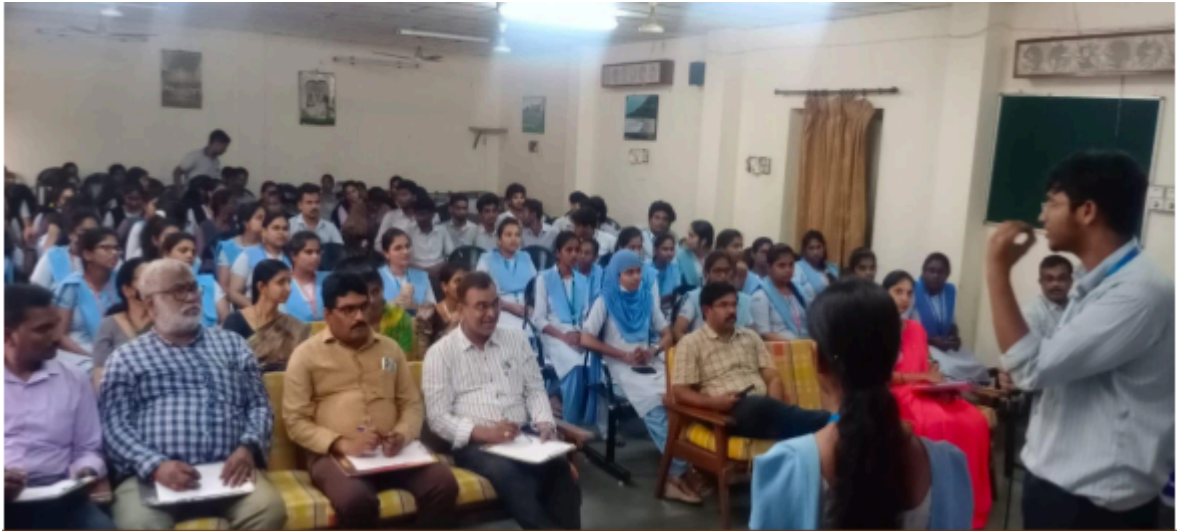
State level Poster& PowerPoint presentations