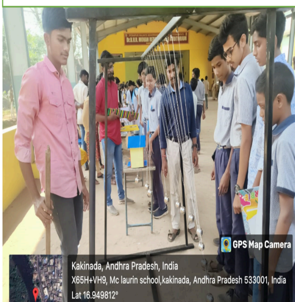
Students Exhibiting Science projects