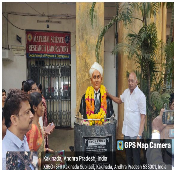
Staff and Alumni garlanding Sir C.V Raman Statue