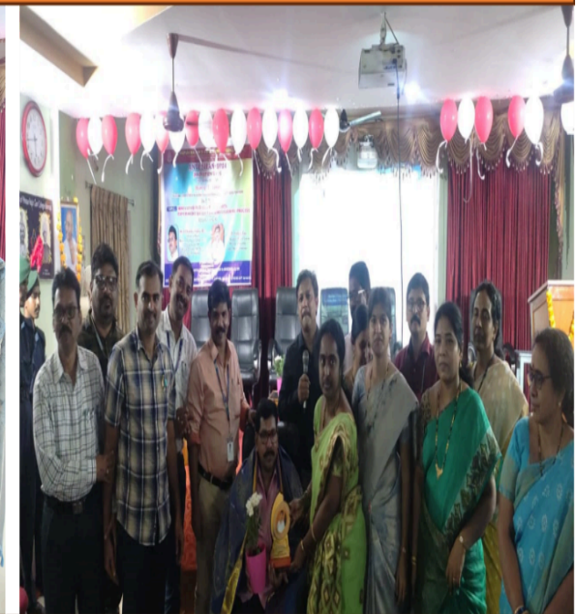
Principal,Staff felicitating the speakers