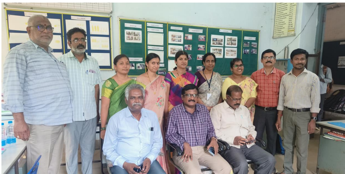
Staff along with the BOS members