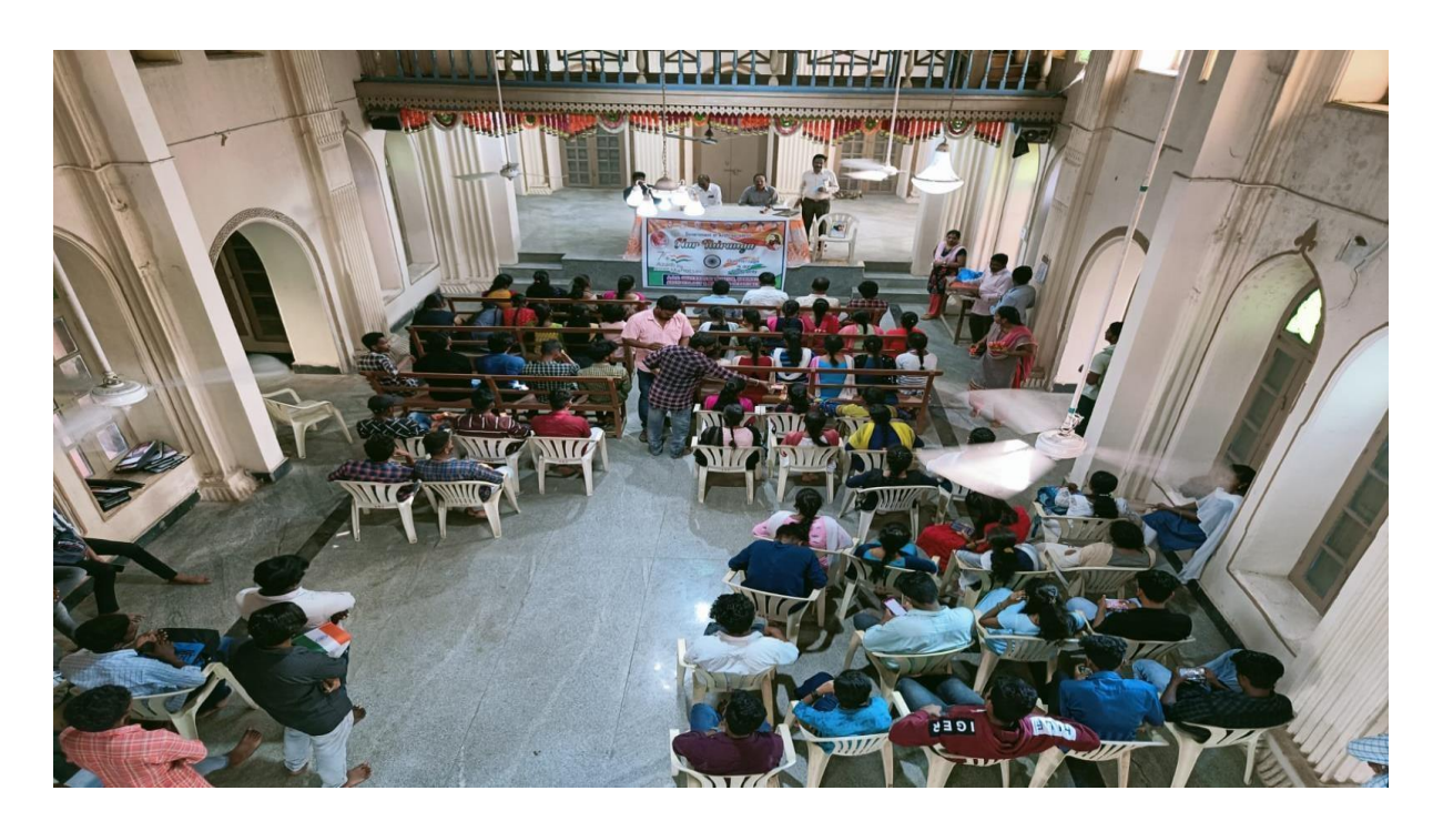
As part of the activity, we visited the Brahma Samaj in Kakinada with 300 students and staff members.