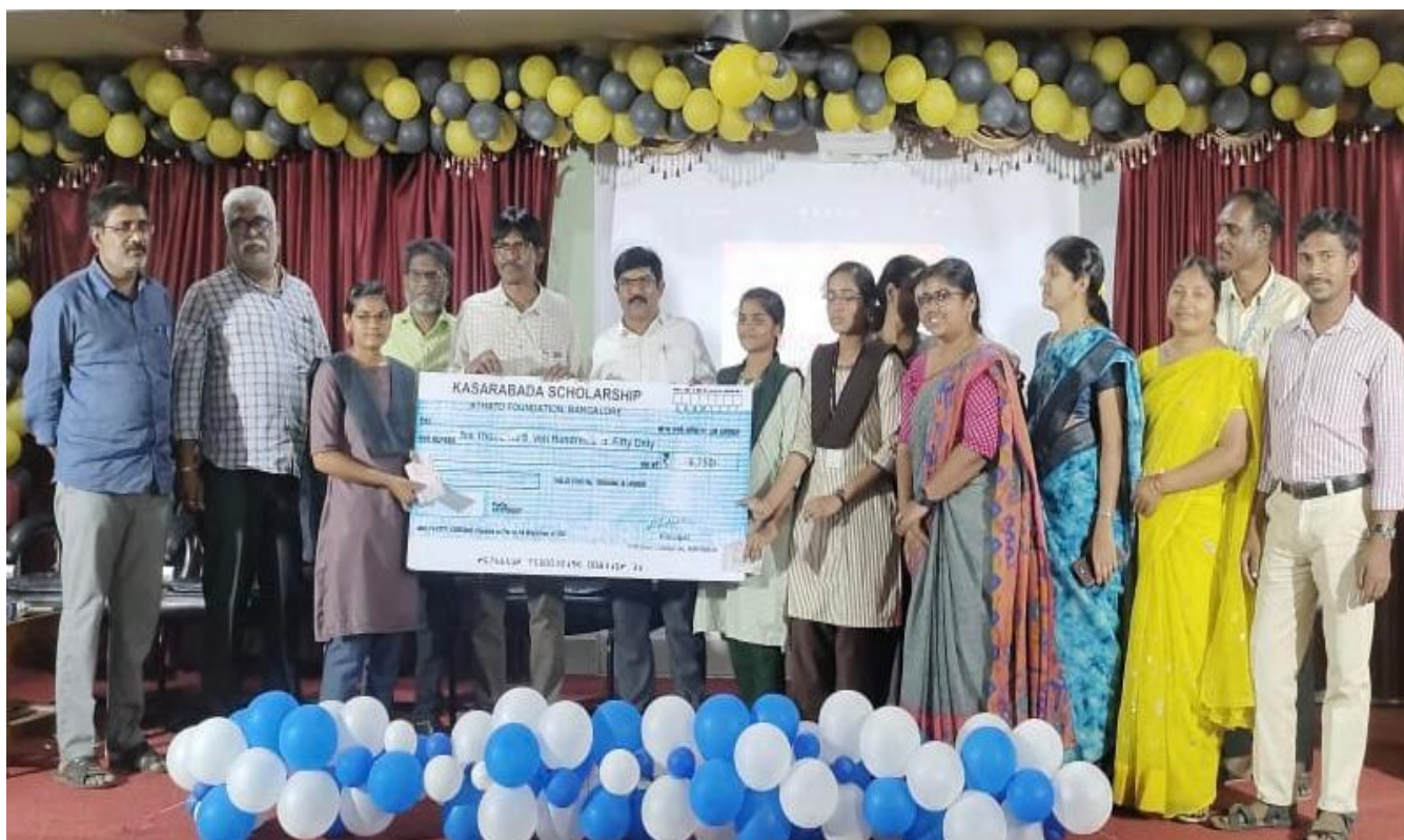
U.G. – PHYSICS TOPPERS distribution of Rs20,250/-