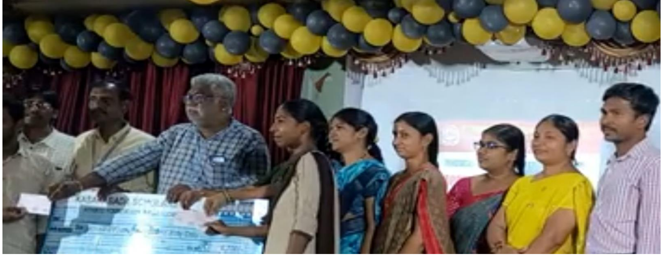
Computer Science PROJECTS - distribution of Rs5000/-