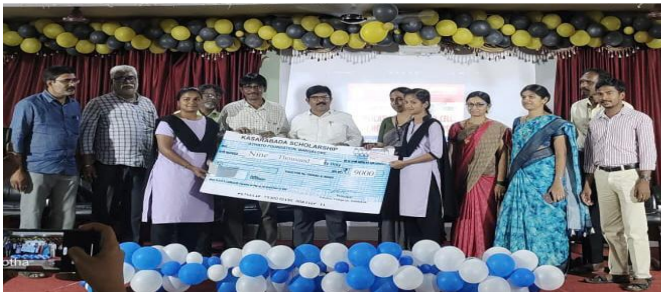
P.G. – PHYSICS TOPPERS distribution of Rs18,000/-