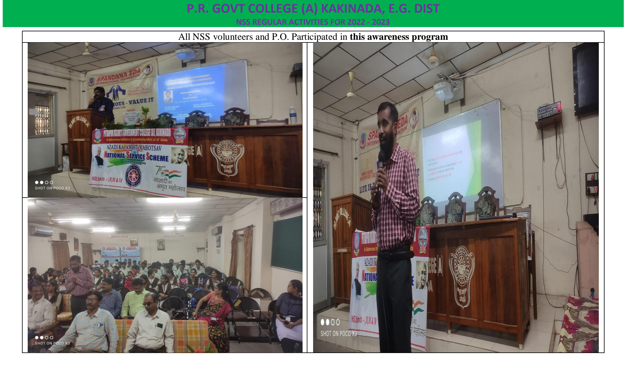
12<sup>th</sup> September, 2022 Beach Cleaning "Massive Cleaning Program by all Volunteers