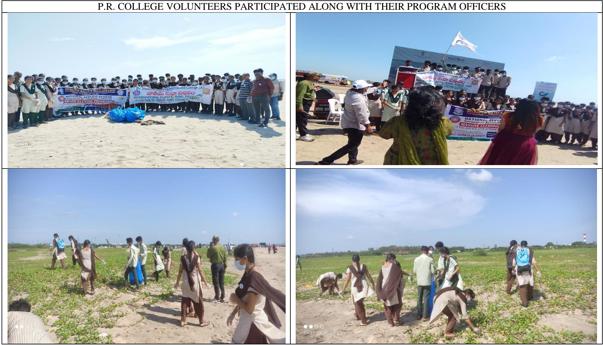
24<sup>th</sup> Septmeber, 2022 NSS DAY Celebrationds

All four units participated in this program