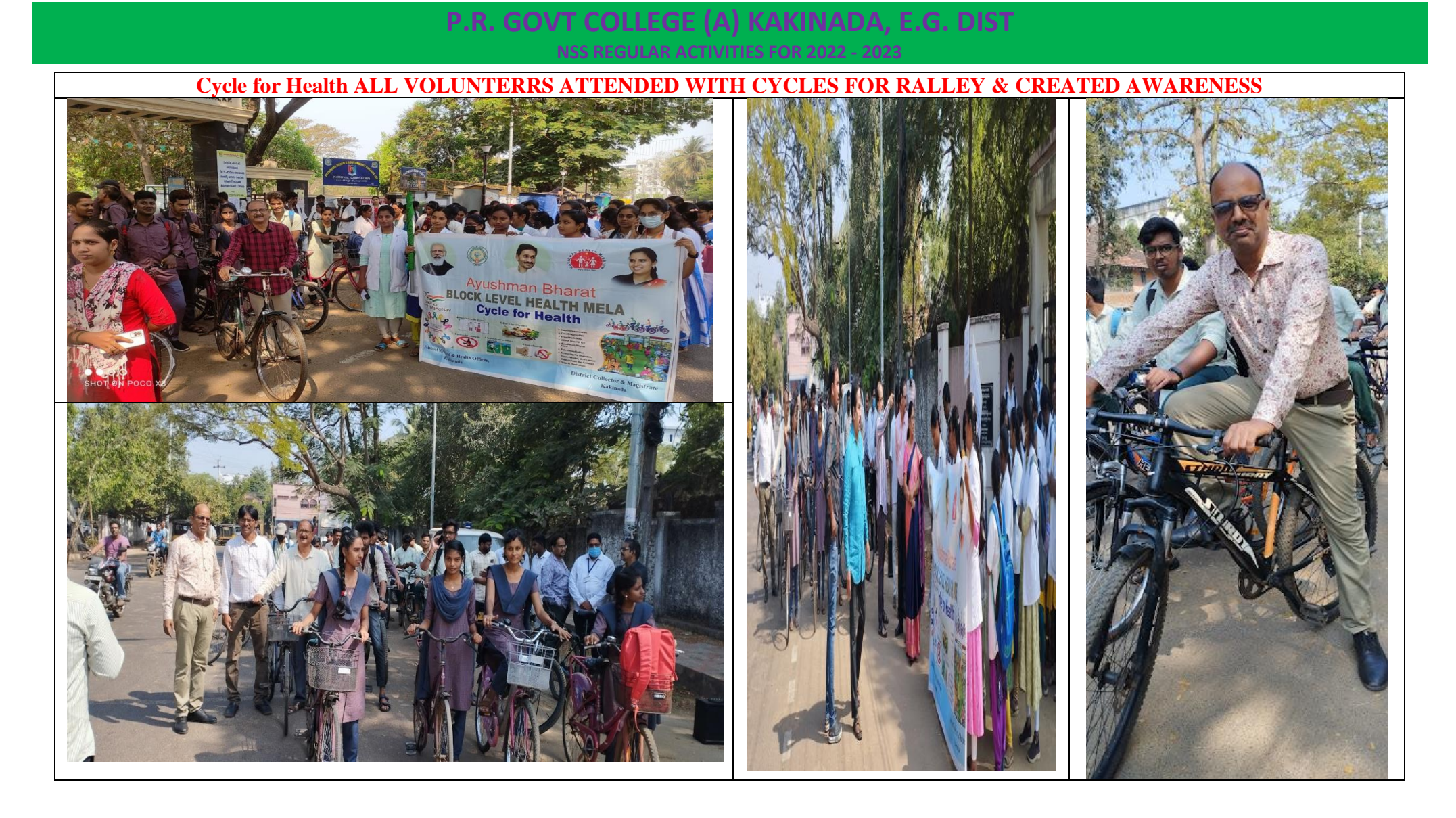
Between February and March 2023 "a 15 Days "Remedial Classes in BC Hostels by our NSS Volunteers