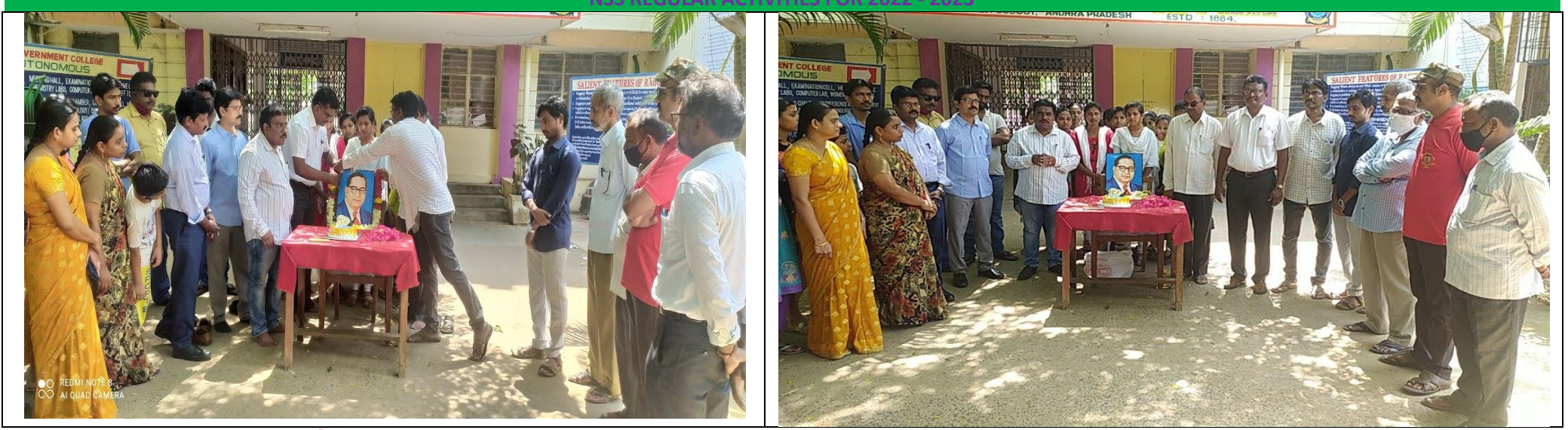
18th April, 2022 conducted World Heritage Day – in association with INTACH, East Godavari Chapter